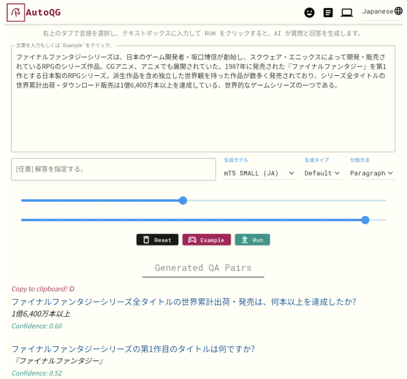
Figure 3: A screenshot of AutoQG with an example of question and answer generation over a paragraph in Japanese.

Figure 2 and Figure 3 show examples of the interface with English and Japanese QAG, where there is a tab to select QAG models, language, and parameters at generation including the beam size and the value for nucleus sampling (Holtzman et al., 2020). Optionally, users can specify an answer and generate a single question on it with the QG model, as shown in Figure 4. A short introduction video to AutoQG is available at https://youtu.be/