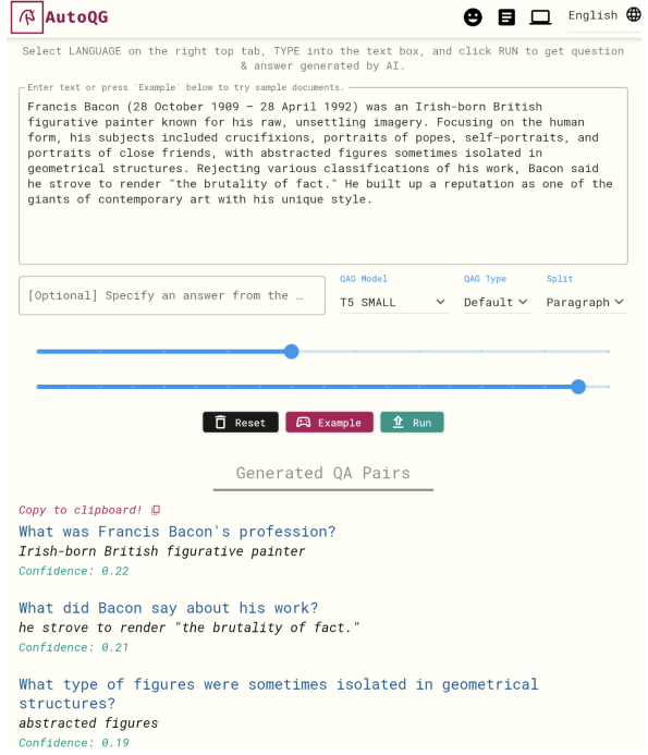
Figure 2: A screenshot of AutoQG with an example of question and answer generation over a paragraph.