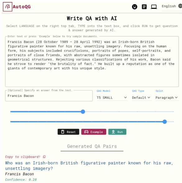
Figure 4: A screenshot of AutoQG when an answer is specified by the user.